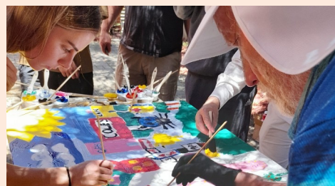
Tenants at an art class in Subiaco.

We want our Community Engagement Program to respond to your needs!